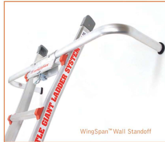
WingSpan™ Wall Standoff