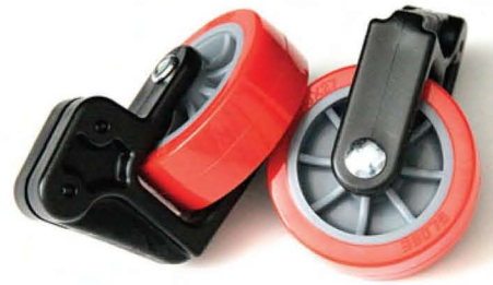
Tip & Glide™ Wheels