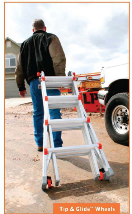
Tip & Glide™ Wheels